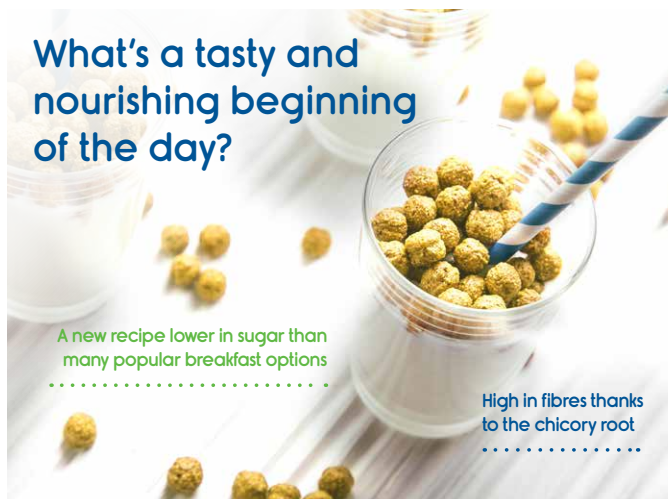
Marketing product concept, developed by and for BENEО.