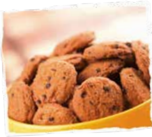
Fig. 1: Comparing cookie hardness (g).

On the other hand, a cook-up native waxy rice starch, like our Remyline XS, improves the brittle texture mostly lacking with fat-reduced gluten-free cookies. Additionally, our rice syrup Remylose 58 80 is most suitable in gluten-free products imparting both taste and texture to the product.