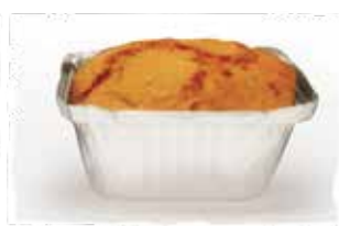
Remyflo R7 90 T