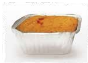
Standard milled rice flour