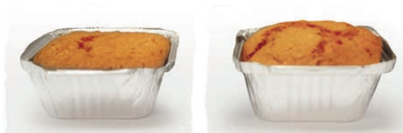
Standard milled rice flour