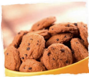
Fig. 1: Comparing cookie hardness (g).

On the other hand, a cook-up native waxy rice starch, like our Remyline XS, improves the brittle texture mostly lacking with fat-reduced gluten-free cookies. Additionally, our rice syrup Remylose 58 80 is most suitable in gluten-free products imparting both taste and texture to the product.